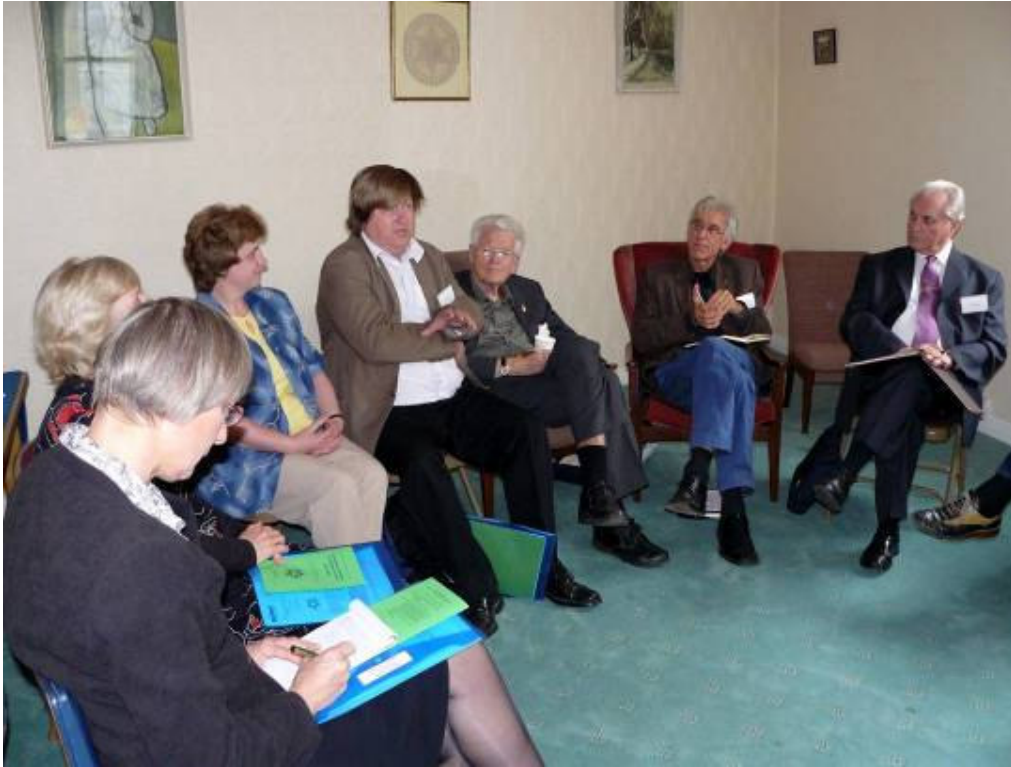
Ye typical workshope