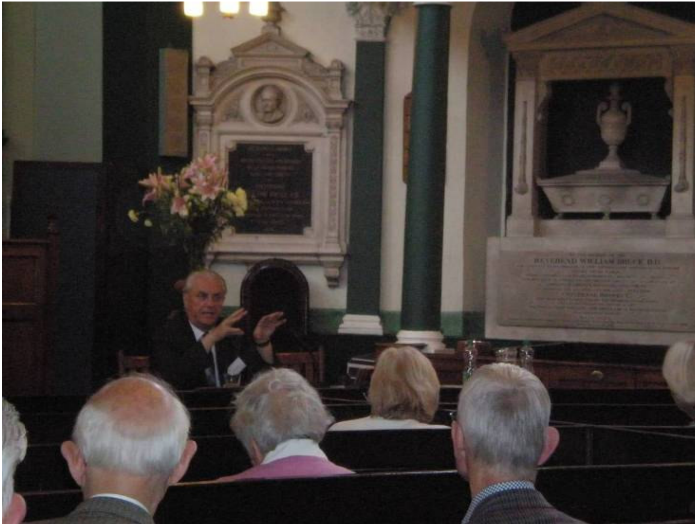
Bishop Árpád Szabó