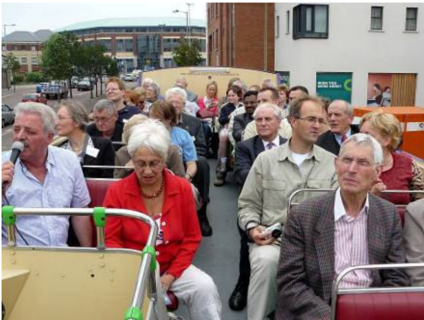
On the tour bus