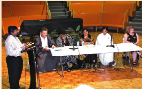
Panel discussion at the general meeting of IARF