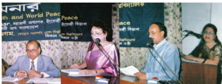
Seminar on 'the Bahai Faith and World Peace'