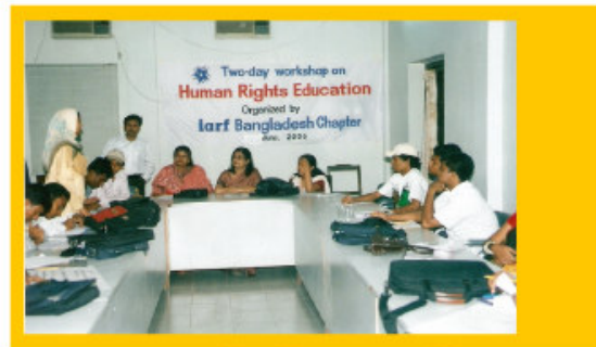
A session of HRE training

Each series of the course was divided into five sessions. Participatory discussion took place on Universal Declaration of Human Rights (UDHR) and discrimination against religious minority groups. Three videos were shown in the sessions and participants were asked to identify the incidences of violation of religious rights in the stories.