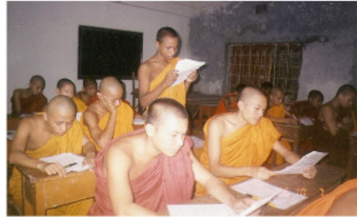
A section of participants of HRE training held at the Kamalapur Buddhist Temple, Dhaka