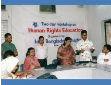
A session of HRE training

The trainees spontaneously participated in the plenary and group sessions. They could identify the rights violated in the videos shown to them. They also related the issues with the human rights situation in Bangladesh. They made some creative presentations on HR with the elements of entertainment. Many of the participants expressed their keen interest in working as human rights activist. They also made some